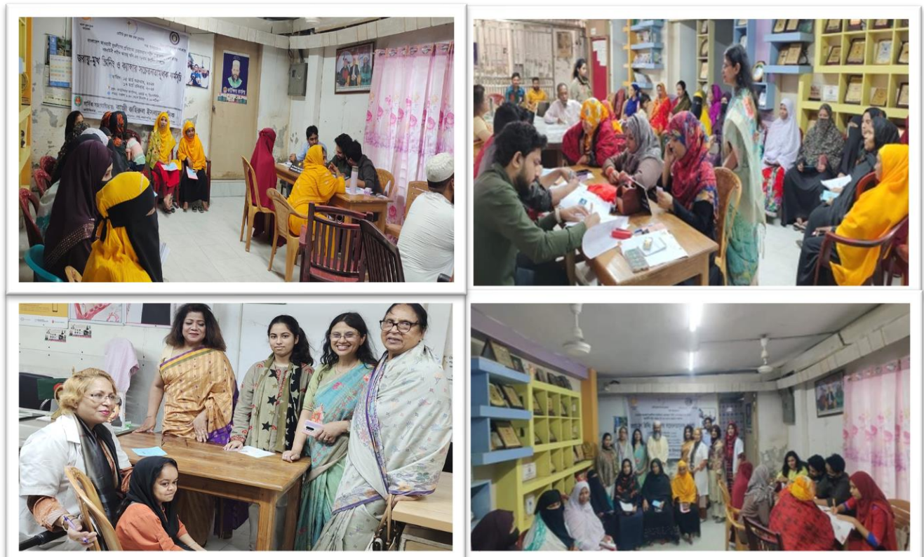
Figure 3: Screening Program on Cervical Cancer and Awareness.