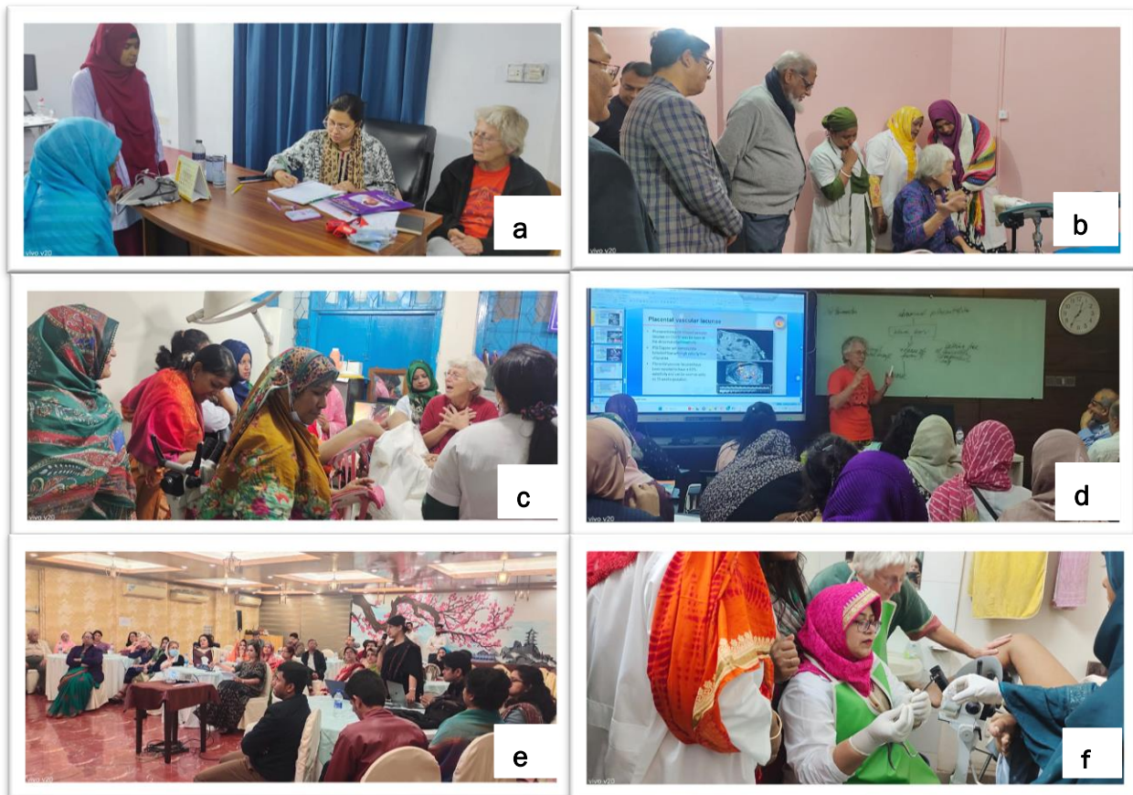
Figure 2: Training Activities- a) Patient Consultation at RBHC with the cooperation of RBHC doctor, b) Instructions for VIA at Bangladesh Cancer Society, c) Providing VIA training at Dhaka Medical College and Hospital (DMC), d) Ultrasonogram Training at Sristy Foundation, e) Awareness Program with Rotary Club of Dhaka Dhruva Tara, f) Providing VIA training at Tajuddin Medical College and Hospital (TMCH).

Dhaka Medical College Hospital (DMCH) Shaheed Tajuddin Ahmad Medical College, Gazipur Mymensingh Medical College Hospital, Mymensingh